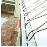
Snow Melting and De-Icing