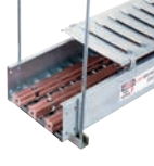
Fire and Performance Wiring