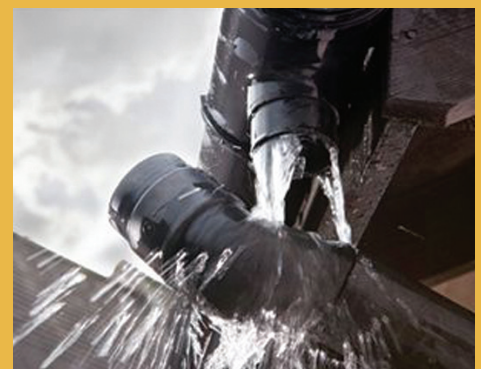
Plumbing systems and suspended pipes