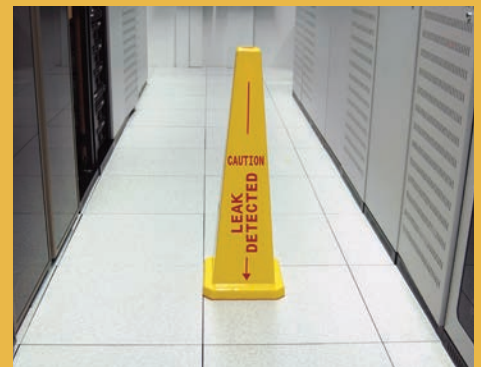
Raised floor computer facility